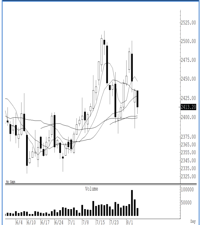
GOU24 (Close 2,413.20 Chg -22.0)

ราคาทองคำโลกผันผวนต่อเนื่อง เราแนะนำยกการ์ดสูงหรือตั้ง stop ไว้จากความผันผวนของราคาที่เราคาดว่าจะแกว่งแรง แนะนำ trading ในกรอบ 2,435-2,390 ดอลลาร์ รับรู้กำไร ในกรณีที่ปิดต่ำกว่าระดับ 2,380 ดอลลาร์ แนะนำ ถือ short หวังผลปรับตัวลงไปแถว ๆ 2,340 ดอลลาร์ รับรู้กำไร